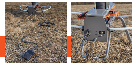
Foot Pedal 3 Launch Angles