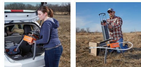
Compact Design Detachable Magazine