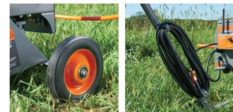
Heavy Duty Wheels Cord Storage