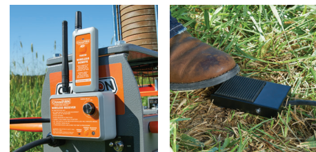
Wireless Remote Foot Pedal